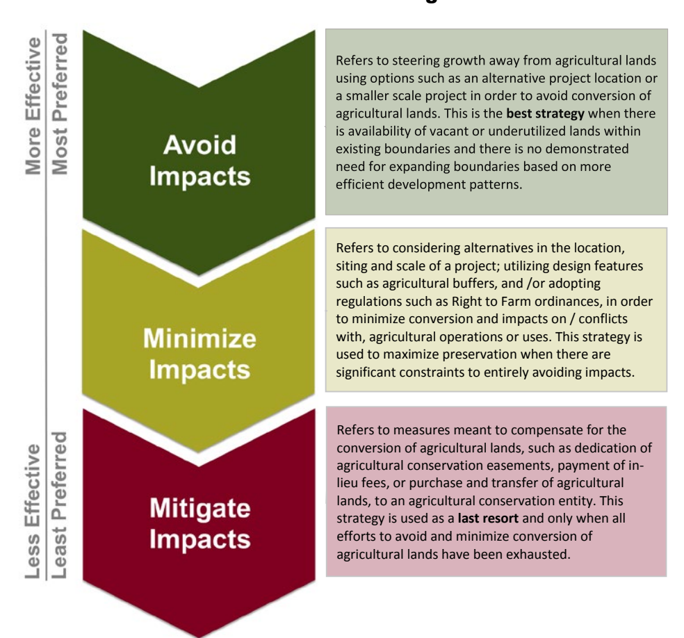
Figure 3. Hierarchy for Agricultural Land Preservation Strategies

LAFCo's unique mandates to preserve prime agricultural lands and discourage urban sprawl, and the fact that agricultural lands are a finite and irreplaceable resource, make it essential to avoid adversely impacting agricultural lands in the first place.