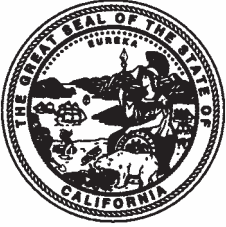
Gray Davis GOVERNOR