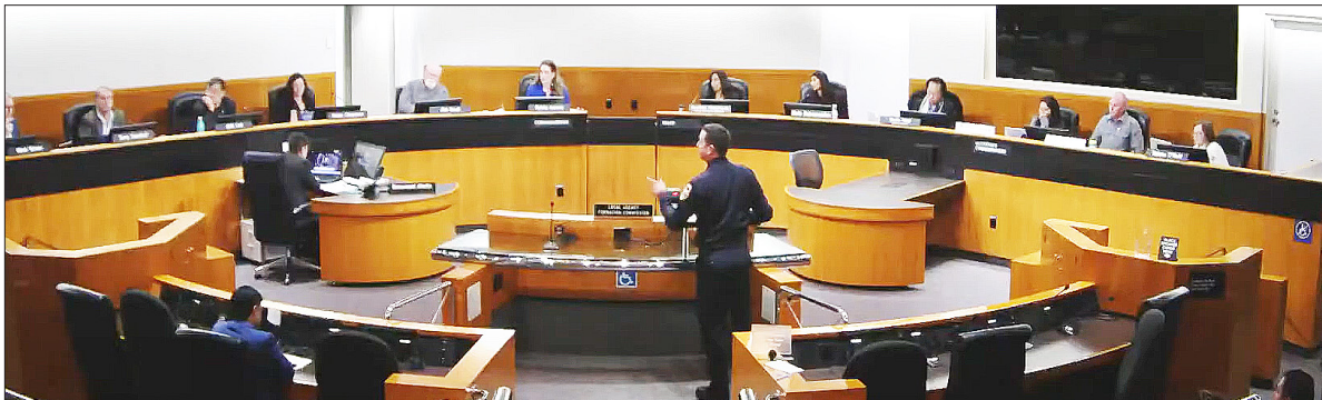
SCFD Dissolution/CCFD Annexation & SOI Amendment Public Hearing (4/2/2025)

In February 2025, LAFCO received a joint application from the South Santa Clara County Fire Protection District (SCFD) and the Santa Clara County Central Fire Protection District (CCFD) proposing a reorganization of the two districts. The proposal called for dissolving SCFD, annexing its 288-square-mile territory consisting of unincorporated areas surrounding the cities of Morgan Hill and Gilroy in southern Santa Clara County – to CCFD, and amending CCFD’s Sphere of Influence (SOI) to incorporate the former SCFD SOI. The reorganization aimed to address SCFD’s ongoing operating deficit and provide sustainable, reliable fire protection services to the community.