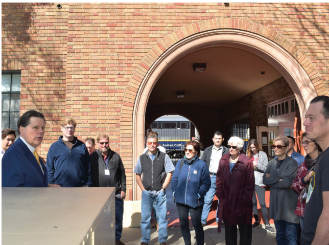
Attendees tour the historic Diridon Station and get the story behind the anticipated Google transit village and the City’s revitalization plans for the area.