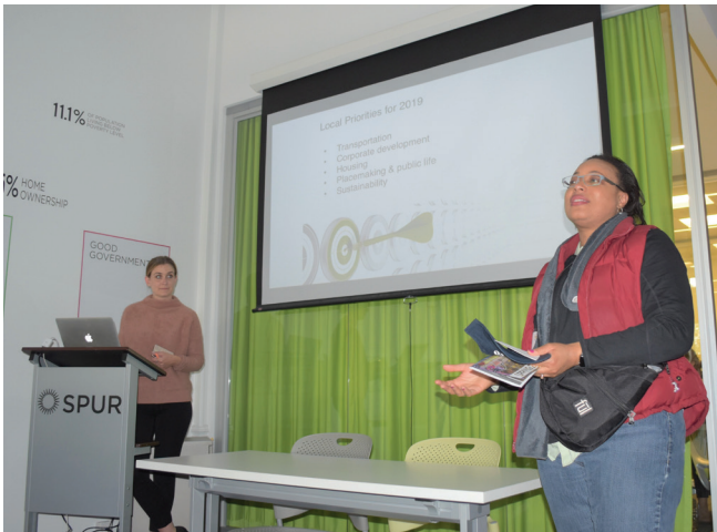
Attendees stop at the SPUR San Jose Office to hear about efforts to promote good planning in San Jose, through research, education and advocacy.